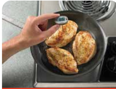
Check with a Food Thermometer