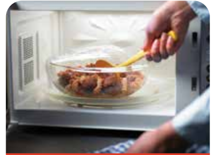
Microwave to Safe Temperatures