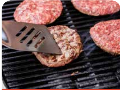
Color is Not a Reliable Indicator of Safety